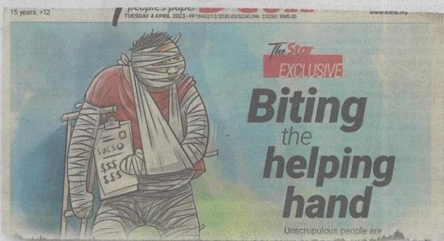
Flashback: An exclusive report published by 'The Star' on April 4 last year on alleged Socso claims.